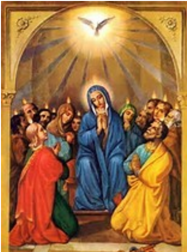
May 23 - Pentecost