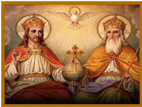
May 30 - Most Holy Trinity