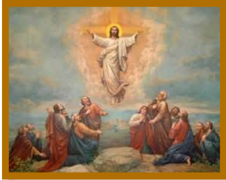
May 16 - Ascension