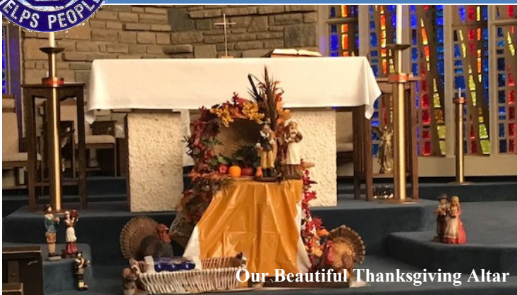
Our Beautiful Thanksgiving Altar