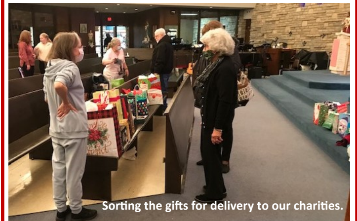
Sorting the gifts for delivery to our charities.

Once again Church of Our Lady has come through for the needy. Each agency will be pleased and appreciative of all the gifts under the Giving Tree. What an awesome sight it was!