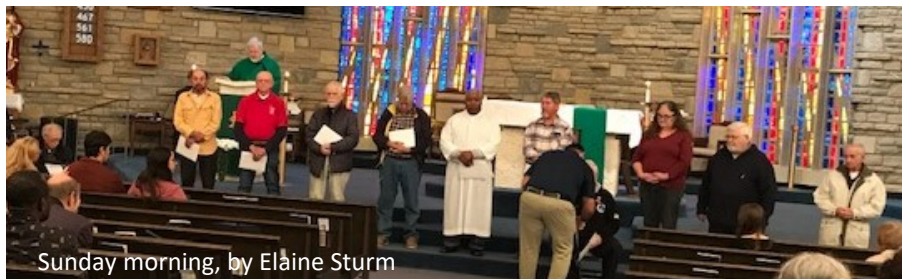
Sunday morning