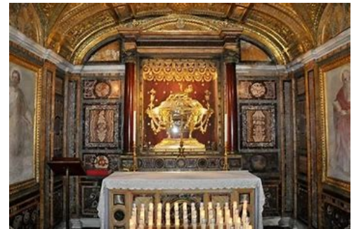
Crypt of the Reliquary of the Crib of Jesus

We find at all events that the basilica erected by Pope Liberius (352-366) on the Esquiline Hill first received the name of Sancta Maria ad Praesepe under Pope Theodore. During the pontificate of Hadrian I the first Altar was erected in the Basilica; in the course of succeeding centuries the place where the relics are preserved came to be visited by the devout faithful from all parts of the Christian world.