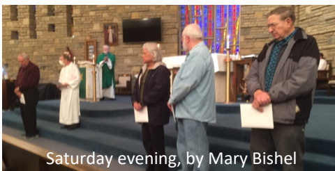
Saturday evening